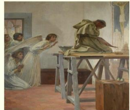
Fra Angelico Visited by Angels, by Paul-Hippolyte Flandrin

At the end of Mass a blessing will be offered for all Faculty, Staff, and Students in the College of Arts.