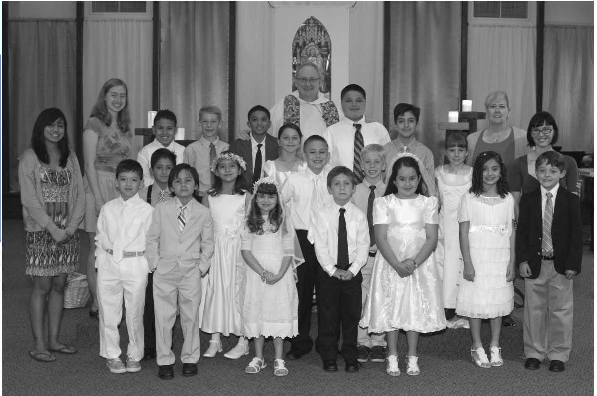
This Year's First Communion Class